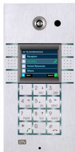
2N® Helios IP Vario