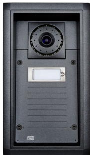
2N® Helios IP Force