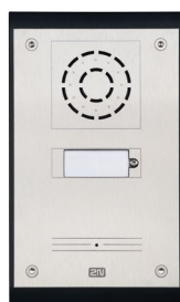
2N® Helios IP Uni

The 2N® Helios IP family is a wide range of door intercoms for every situation - whether in security, business, emergency, or any other special area.