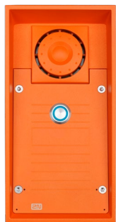
2N® Helios IP Safety